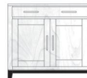
HO65418 36.9375W | 37.875W Optional Metro Legs: CAPL50 32.5H