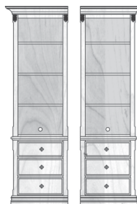
HT44562 L/R 25.0625W | 28.125W