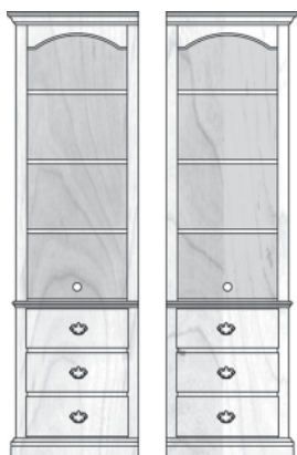
HT06562 L/R 23.8125W | 25.625W