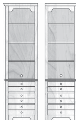
HT17562 L/R 23.625W | 25.25W