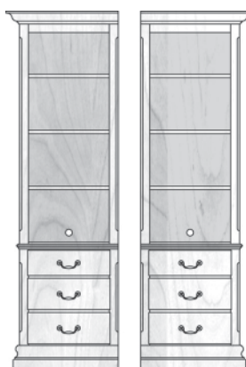
HT33562 L/R 25.0625W | 28.125W