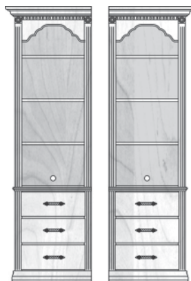
HT11562 L/R 24.75W | 27.5W