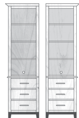
HT65562 L/R 24.125W | 26.25W Optional Metro Legs: CAPL50 82.5H