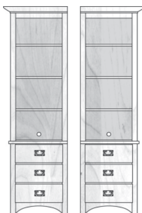
HT54562 L/R 24.8125W | 27.625W