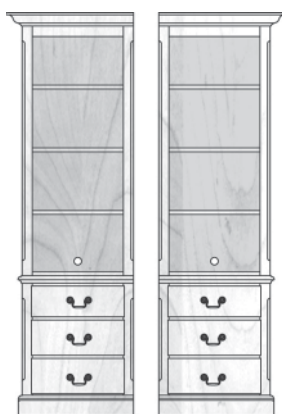
HT51562 L/R 25.0625W | 28.125W