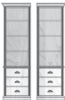
HT20562 L/R 24.1875W | 26.375W